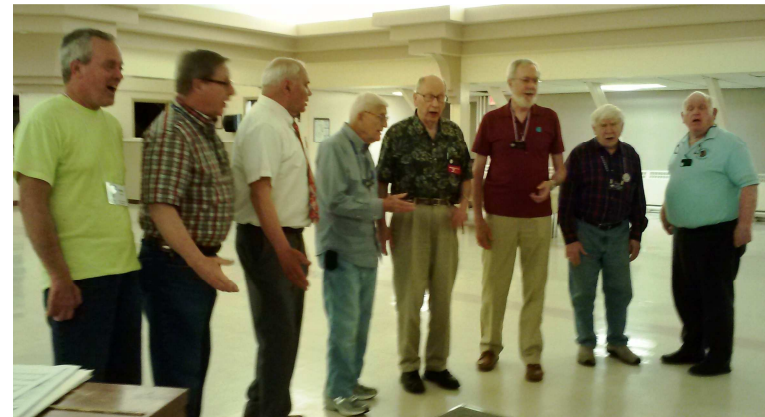
Octet, May 20, 2014