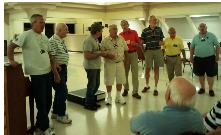
Octet, May 27, 2014