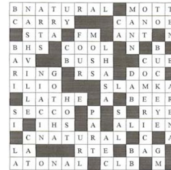
Big Chief Chorus Holiday Crossword Puzzle, Solution